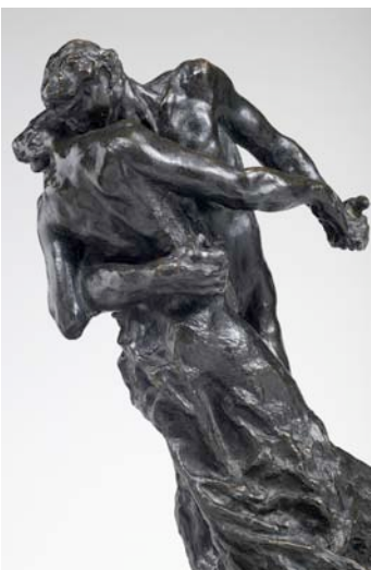
La Valse ©Musée Rodin (Photo Ch. Baraja) ©ADAGP, Paris