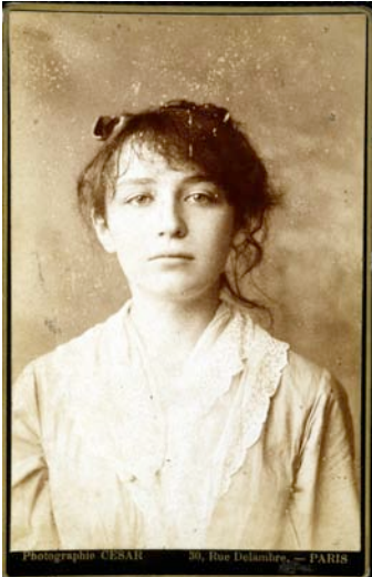
Portrait de Camille Claudel à 18 ans